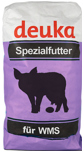
Sackfoto_deuka_Futter für die eierlegende Wollmilchsau (WMS) (© eositionist - stock.adobe.com).

Flour, pellets, granules: The new product range is available in all common feed structures. This means that farmers can ensure the supply of feed for their animals regardless of the feeding technology used. All products are designed as fully mineralized and vitamin-enriched complete feeds.