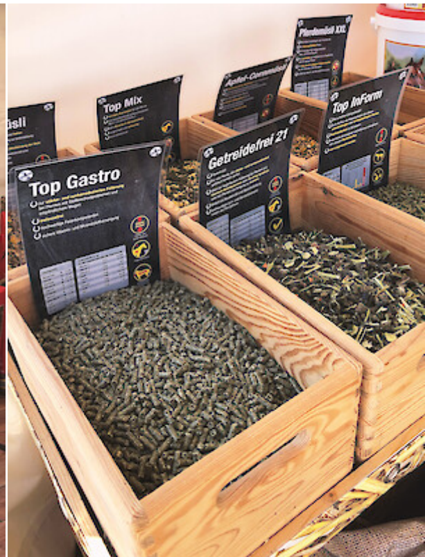
The new deukavallo range only almost outshines the good mood of product manager Theresa Oesterwind during her visit to Equitana Open Air 2021 (© Deutsche Tiernahrung Cremer). Feed samples give visitors a look inside the deukavallo feed bags (© Deutsche Tiernahrung Cremer).