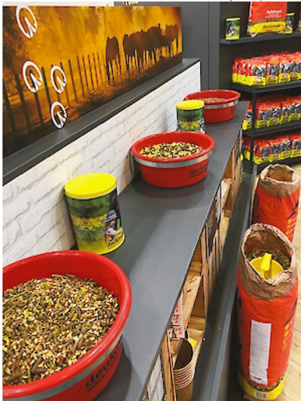
deukavallo feed at our stand at Equitana (© Deutsche Tiernahrung Cremer).