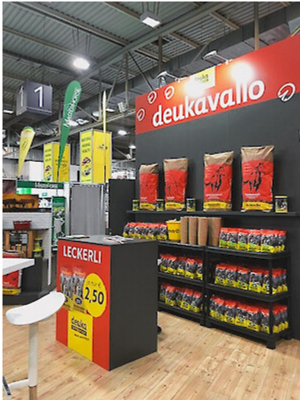
The new deukavallo stand awaits the rush of visitors at Equitana (© Deutsche Tiernahrung Cremer).