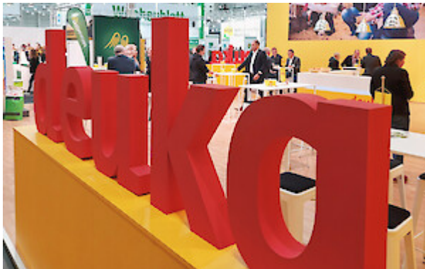
deuka - Also at the AGRAR Unternehmertage 2022 our most important brand for the supply of pigs, cattle and poultry.