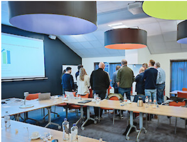
Impressions of the deuka prestarter workshop in the Netherlands_(C) Deutsche Tiernahrung Cremer (10)