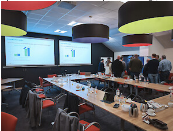
Impressions of the deuka prestarter workshop in the Netherlands (11)