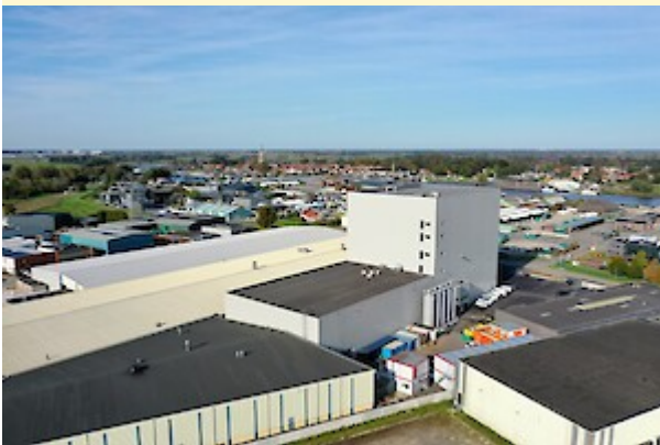
The provimi plant in Hasselt (Netherlands) Modern production at the highest level.