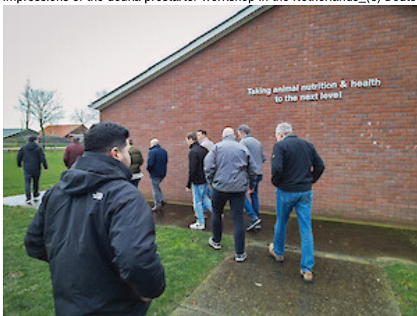
Impressions from the deuka prestarter workshop in the Netherlands (14)