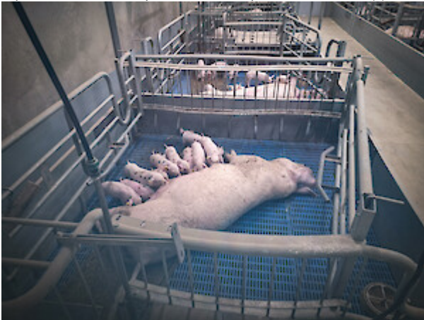
Impressions from the deuka prestarter workshop in the Netherlands (17)